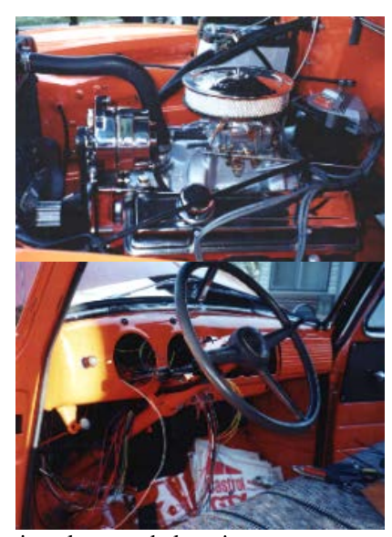
getting closer and closer!

Good news on the Chevy truck front! The engine is fixed, mounted in the truck, and test ran. All signs are AOK, and the final work (electrical, instruments, and interior) is going ahead full speed. That first drive is